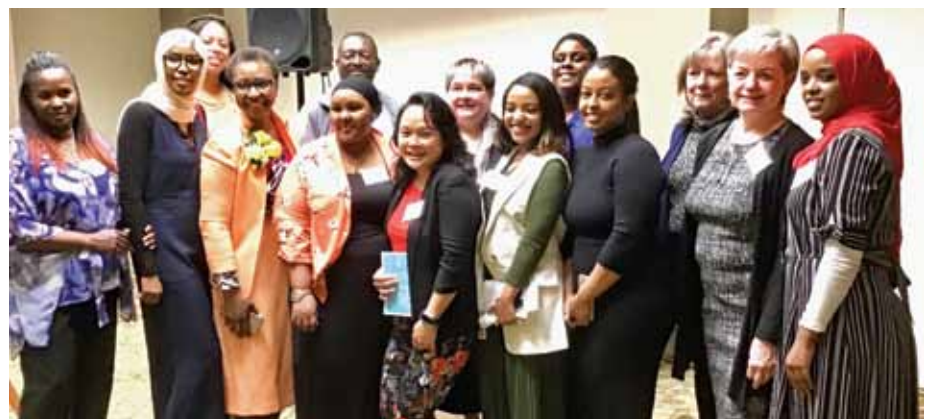
2019 MARY MAHONEY PROFESSIONAL NURSES ORGANIZATION SCHOLARSHIP RECIPIENTS AND COLLEGE OF NURSING FACULTY MEMBERS AT THE MMPNO ANNUAL BANQUET.